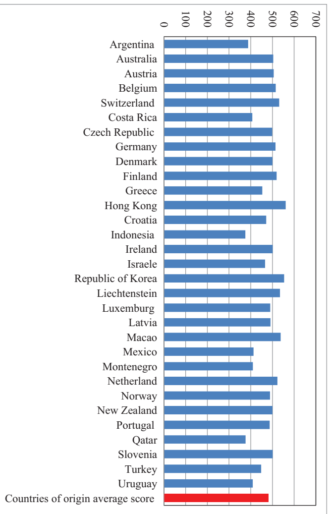
Graph 1 Math scores of the countries of destination of immigrant students and the average score of the countries of origin